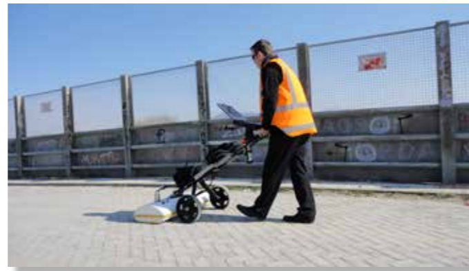
RIS Hi-BrigHT: pavement surveying