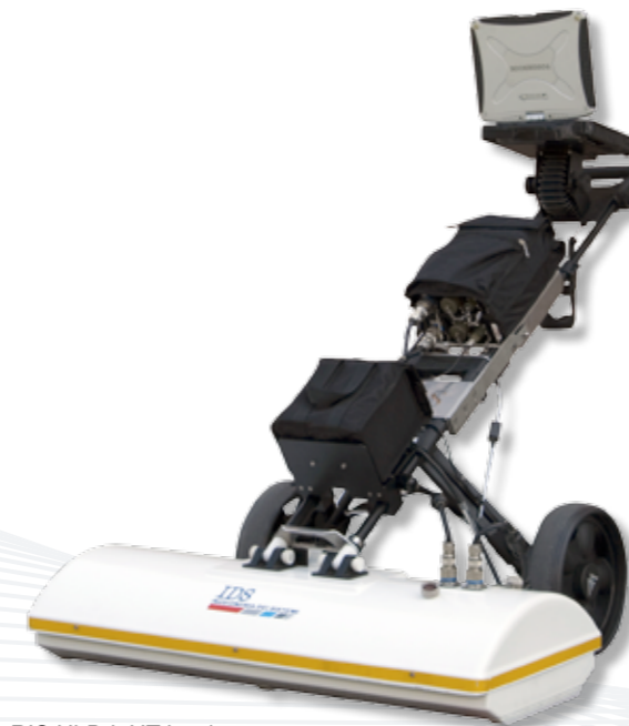
RIS Hi-BrigHT hardware